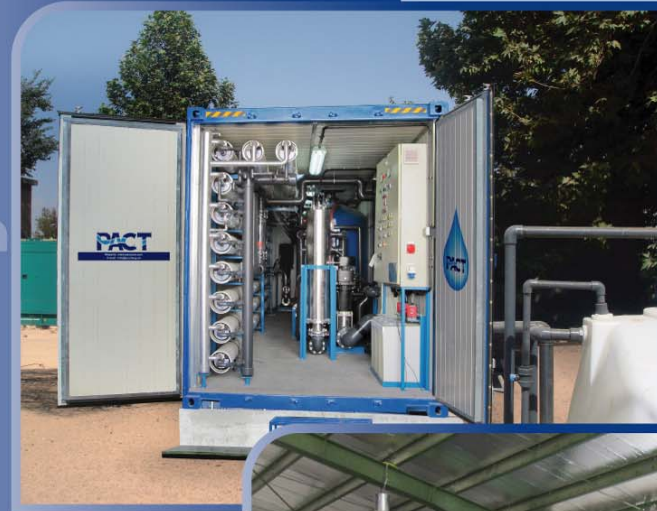
Containerized Reverse Osmosis Plant