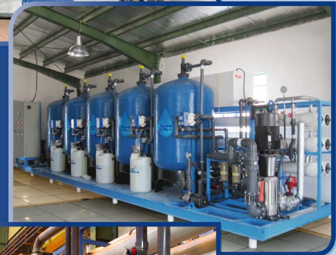
Fully Skid Mounted Reverse Osmosis Plant