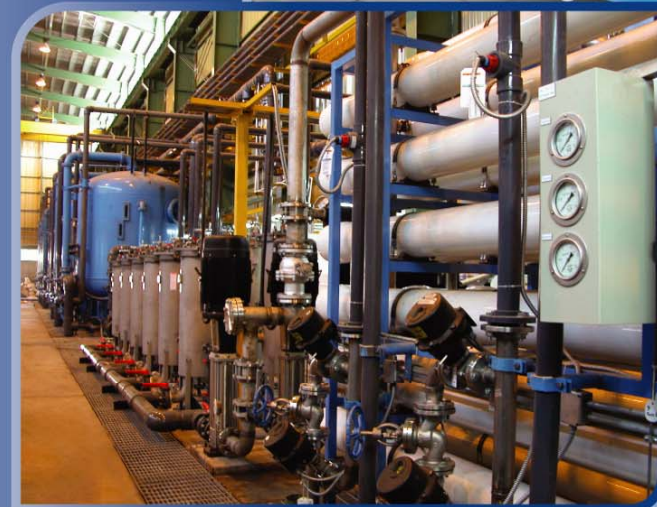
Custom Built Reverse Osmosis Plant